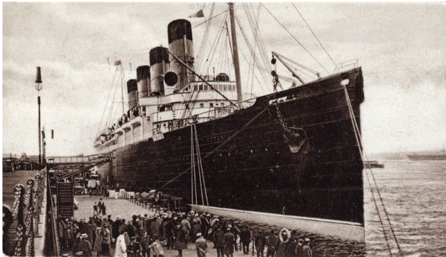
A Liner at Liverpool; from TheGenealogist's Image Archive

TheGenealogist has just released four and a half million BT27 records for the 1920s .