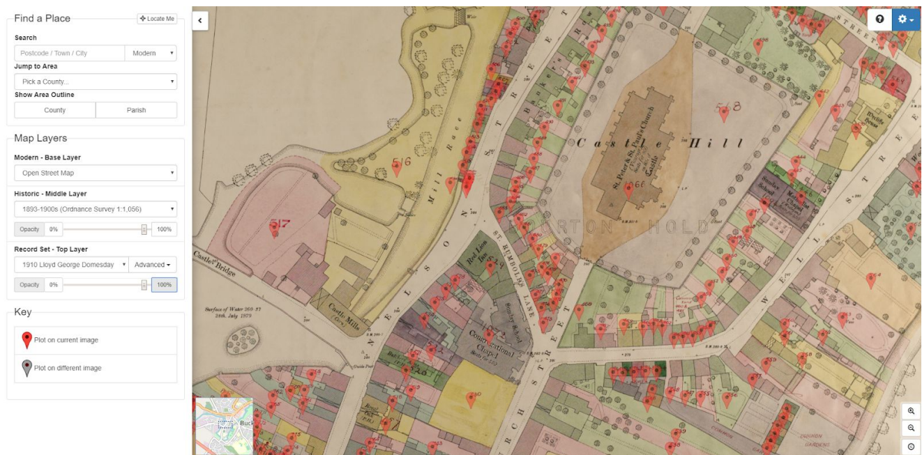
Buckingham, North Buckinghamshire Valuation Office Maps

These records make use of TheGenealogist's powerful new Map Explorer™ to access the maps and residential data, giving those who want to discover where their ancestors lived in the period before the First World War some powerful new features to use. The Lloyd George Domesday Survey records are sourced from The National Archives and are being digitised by TheGenealogist so that it is possible to precisely locate where an ancestor lived on large scale, hand annotated maps. These plans include plots for the exact properties and are married to various georeferenced historic map overlays and modern base maps on the Map Explorer™ which allows the researcher to thoroughly investigate the area in which an ancestor lived.