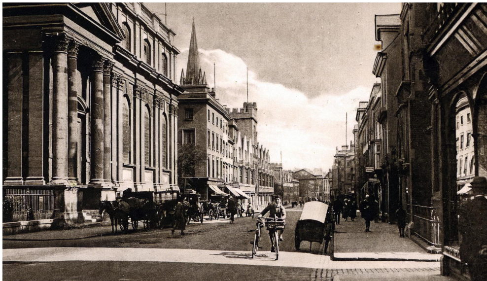
High Street, Oxford

Today sees the launch of a superb new resource for family historians, providing a great way to discover what type of property our ancestors once occupied. TheGenealogist has just added records covering every head of household and property owner in Oxfordshire around the period 1910-1915 with their latest release. Known as the Lloyd George Domesday Survey, the site now has over 2 Million records searchable online from this collection, covering all boroughs of Greater London plus Middlesex, Buckinghamshire, Berkshire and West Hertfordshire, along with the newly added Oxfordshire.