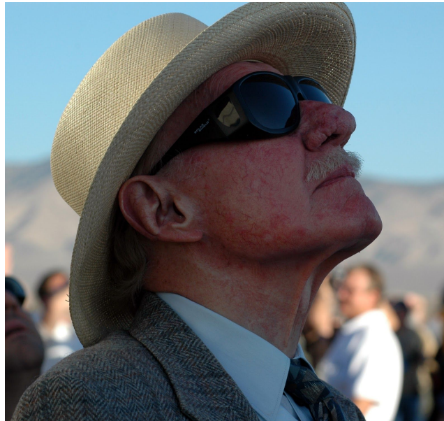
Robert A "Bob" Hoover

Searching these PoW records we can find Robert A. "Bob" Hoover, the former air show pilot and United States Air Force test pilot. Known as the "pilot's pilot", Hoover transformed aerobatic flying in his time and many in the world of aviation saw him as one of the greatest pilots ever to have lived. In the Second World War he was a fighter pilot.