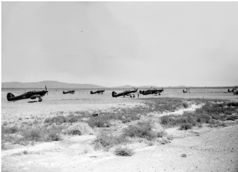
Hurricanes of No. 80 Squadron in Palestine, June 1941 as flown by Roald Dahl

In a release of over 1.8 million records , this batch of R.A.F. Operations Record Books (ORBs) joins TheGenealogist's huge military records collection and includes entries for the famous children's author Roald Dahl when he flew Hurricanes in WW2.