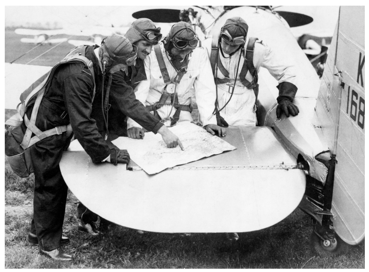
Pilots of 111 Squadron taking part in the 1935 Air Exercises, they are using the tail plane of a Bristol Bulldog fighter to plot their route on a map. This picture was taken during the so-called air panic of 1935, during which German rearmament was revealed and large-scale RAF expansion undertaken in response.

In a release of over half a million records, this is the first batch of RAF Operations Records Books (ORBs) to join TheGenealogist's ever-expanding military records collection.