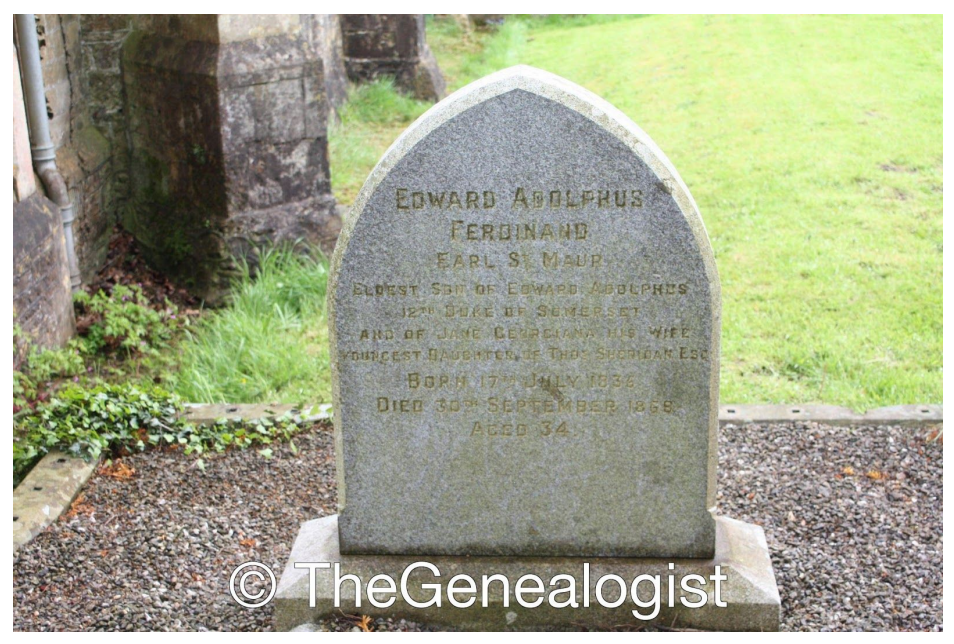
A simple headstone for the Earl St Maur, Eldest Son of Edward Adolphus 12th Duke of Somerset

The International Headstone Collection is an ongoing project where every stone photographed or transcribed earns volunteers credits, which they can spend on subscriptions at TheGenealogist.co.uk or products from GenealogySupplies.com. If you would like to join, you can find out more about the scheme at: <a href="https://ukindexer.co.uk/headstone/">https://ukindexer.co.uk/headstone/</a>