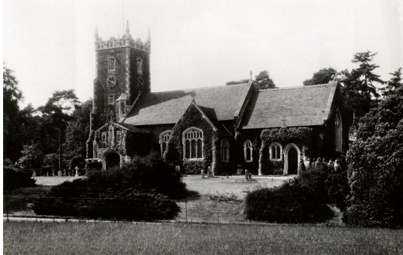
St Mary Magdalene, Sandringham

TheGenealogist has significantly increased their Norfolk Parish Records coverage by releasing 1,445,523 new individuals into their growing Parish Record Collection . These records, which are released in association with the Norfolk Record Office , are fully searchable and transcribed while also being linked to high quality images making them an extremely valuable resource for researchers of this eastern part of England.