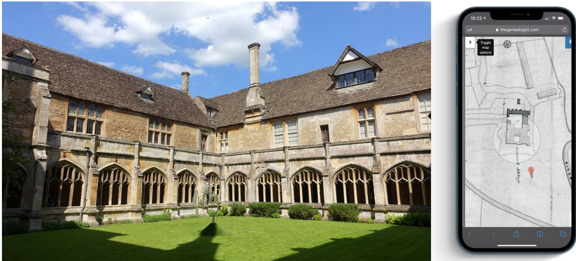
Lacock Abbey on a tithe map accessed on a mobile phone

From a plot identified on the tithe map it is possible to click through to then see the description as it was recorded in the apportionment record at the time, thus revealing more about what an ancestor's holding had been. Using Map Explorer™ the family historian can browse an ancestor's area to find other plots that they owned or occupied. Alternatively, TheGenealogist's Master Search can be used to look for ancestors' plots across the tithe records and then view them on Map Explorer™.